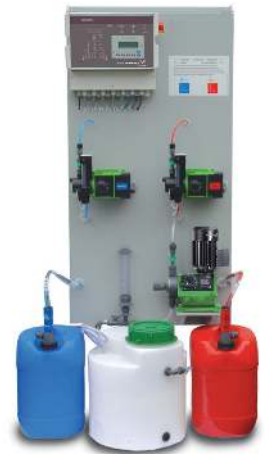
Oxiperm 164 C prepares \text{ClO}_2 from concentrated solutions.

\text{ClO}_2 generators can be easily connected to your existing building management systems and controllers to monitor and record treatment.